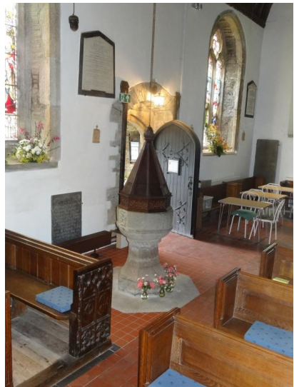
Views of the font after completion of works.

Thanks to the proficiency of our builder and carpenter the project ran very smoothly with no significant hiccups, and was completed within our budget for this phase of the work. The historic pew, re-assembled in its new location,