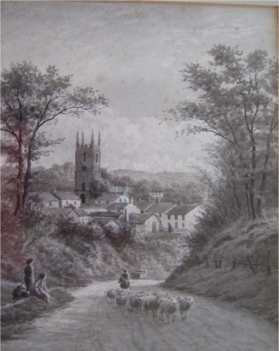
Stratton Circa 1918