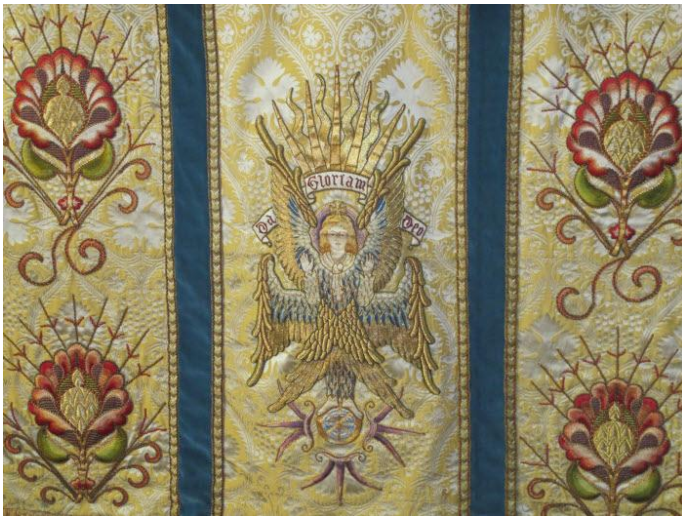
A small section showing the intricate embroidery of the Frontal.