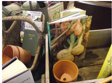
Props on the Crime and Gardening Sections